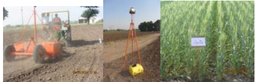
(Department of Agronomy, CoA, JAU, Junagadh) Effect of different irrigation scheduling and irrigation interval through drip on chickpea

The farmers of South Saurashtra Agro-climatic Zone growing wheat in rabi season are recommended to apply 10 irrigations, first immediately after sowing and remaining 9 irrigations at 8-10 days interval (at 0.9 IW/CPE ratio) for securing higher yield and 10 per cent water saving.