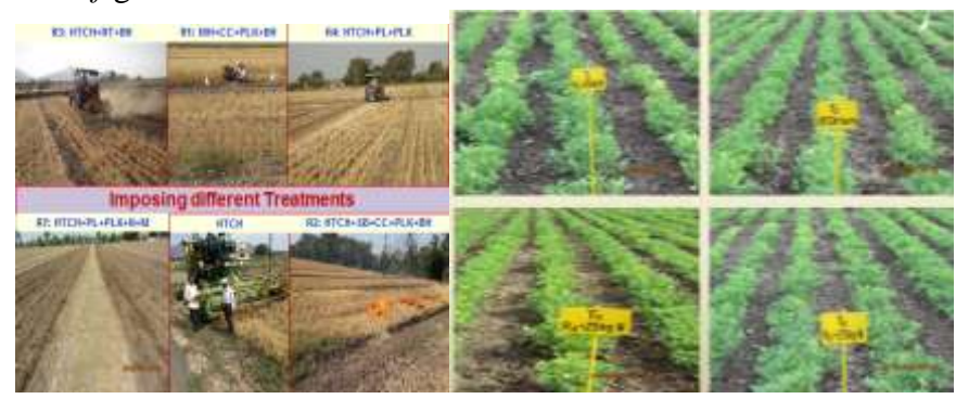
(Department of Agronomy, CoA, JAU, Junagadh)

The farmers of South Saurashtra Agro-climatic Zone who are adopting wheat ( rabi )-fallow-groundnut ( kharif ) crop sequence are advised to harvest the wheat crop by combined harvester and incorporate the wheat straw in the soil with rotavator and blade harrowing + application of 12 kg N/ha (26 kg urea/ha) + Madhyam culture @ 5 kg/ha and give a light irrigation to the soil through sprinkler irrigation system to secure higher production and profitability of kharif groundnut as well as to sustain the soil health.